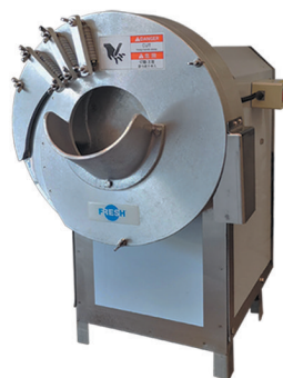
(made in Taiwan)