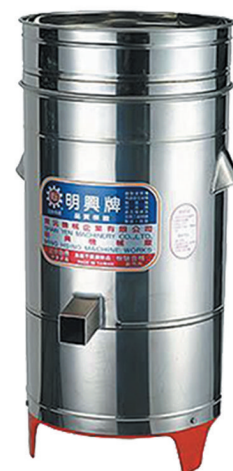
(made in Taiwan)