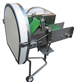
(made in Taiwan)