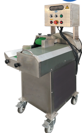
(made in Taiwan)